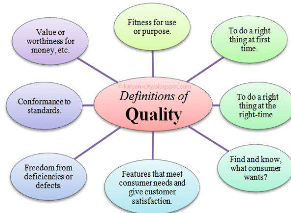
Figure 1: Various attributes of product quality, adapted from Caramela (2020)

They are generally able to offer the lowest service cost and can be used to offer premium services. They act as brand ambassadors for the supplier, encouraging others to purchase the product. Hence, the organisation needs to ensure good quality products in the market and nurture their customers to create a strong bond with them in the short run and then focus on higher profits in the long run over the whole life cycle of customers. Therefore, it can be hypothesised that product quality significantly affects consumer satisfaction ( H_2 ).